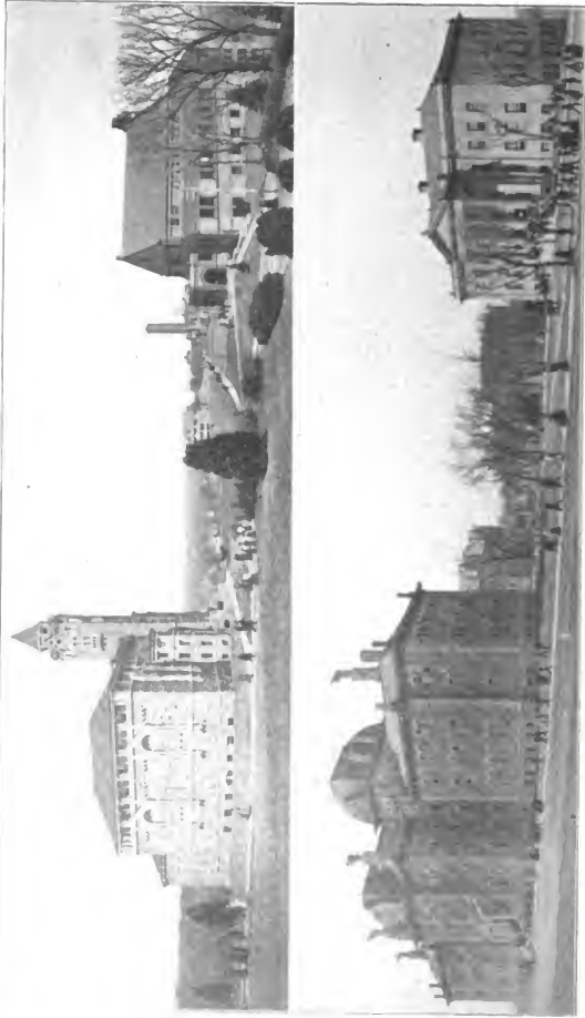
UNIVERSITY OF KANSAS.